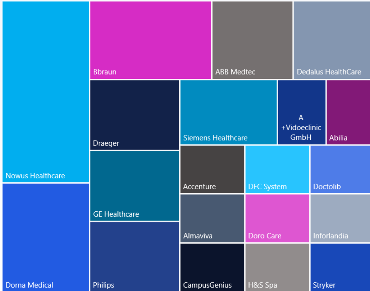
Tender Winners in the field of Telehealth